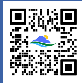
Scan this QR code with your smartphone camera to read about all that is happening at our 2023 WV Annual Conference