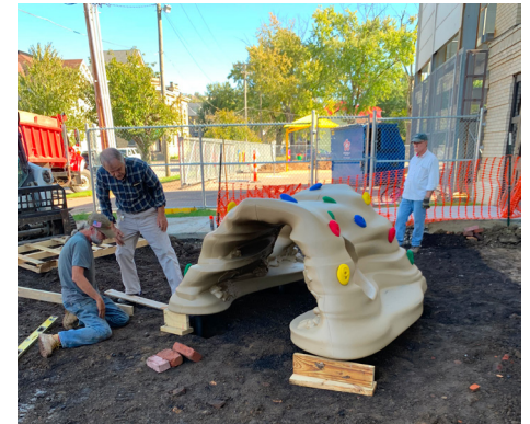
Volunteers with House of the Carpenter in Wheeling work on a new playground.

School-Church partnerships help communities know that their local church is engaged with their needs and is willing to help support them through the highs and lows of growing up and parenting. A resolution is before us this year that asks us to consider such partnerships. This is an initiative that has its roots in existing programs across our state.