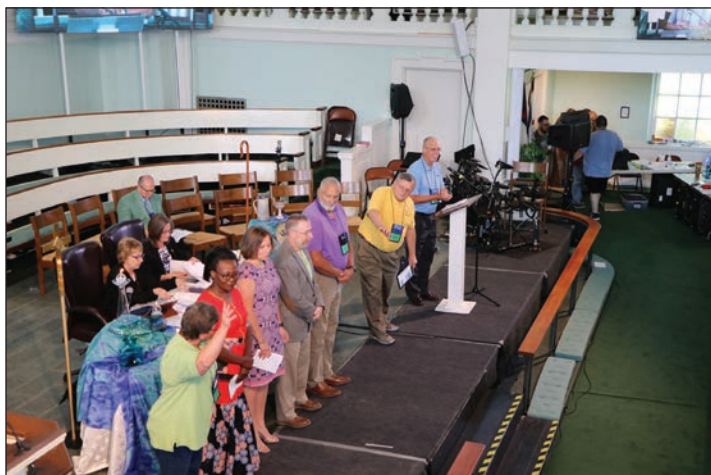
Members of the Conference Disaster Recovery team.