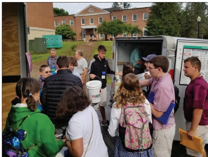
Students unload flood buckets delivered to Conference from the Potomac Highlands District.

Learn more about Disaster Recovery and the Bishop's Appeal at https://www.wvumc.org/disaster-response/disaster-recovery/ .