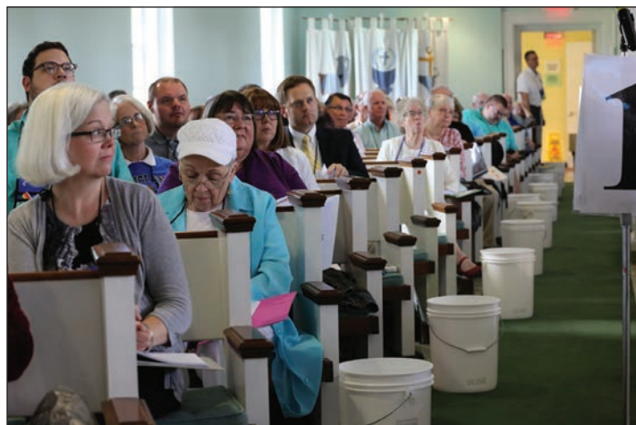
Buckets lined up awaiting the special offering for the Bishop's Appeal for Disaster Relief.