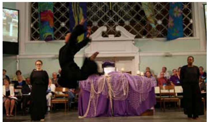
Liturgical dancers from Simpson Memorial UMC were part of last night's celebration.