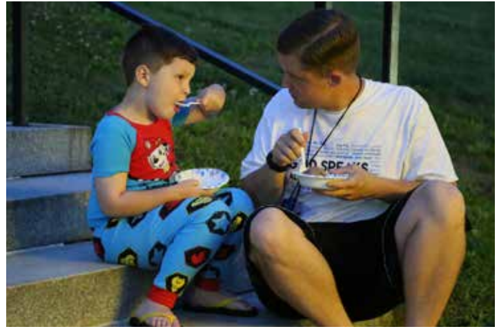
Pajamas and ice cream...does it get any better? Special family moments happen every year at Annual Conference!