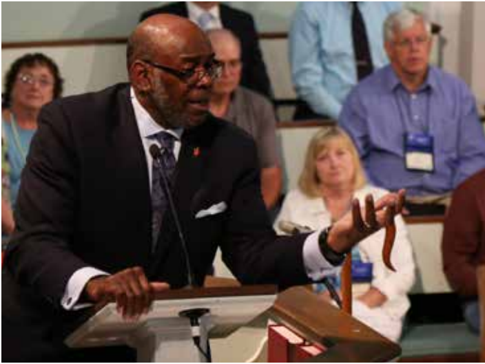
Bishop L. Jonathan Holston's message, "Failure is Not an Option," highlighted West Virginia's historically African American churches celebration.