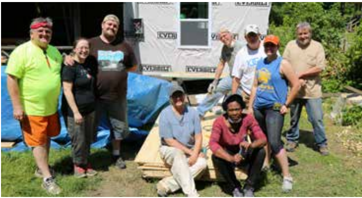
Our Disaster Recovery Team was recognized during Friday's business session.