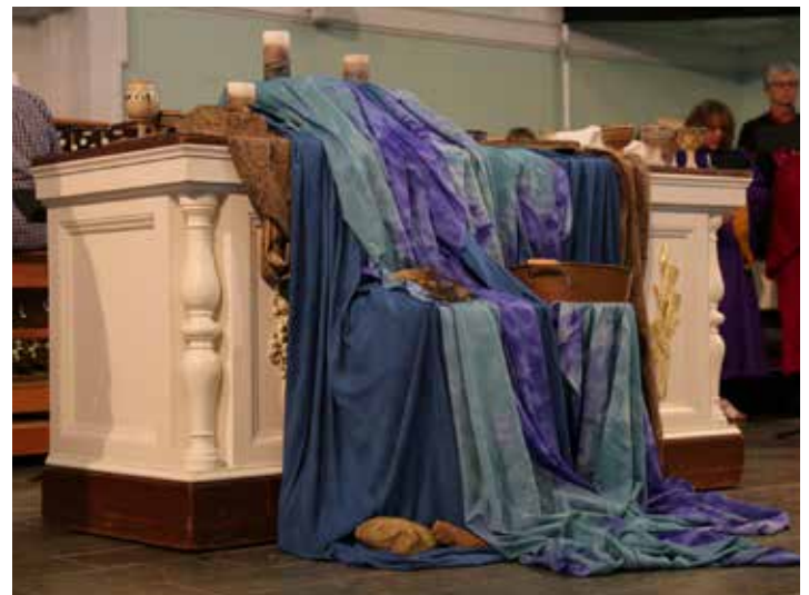
Fabrics representing clean-flowing water were revealed symbolizing hope, healing, and wholeness.