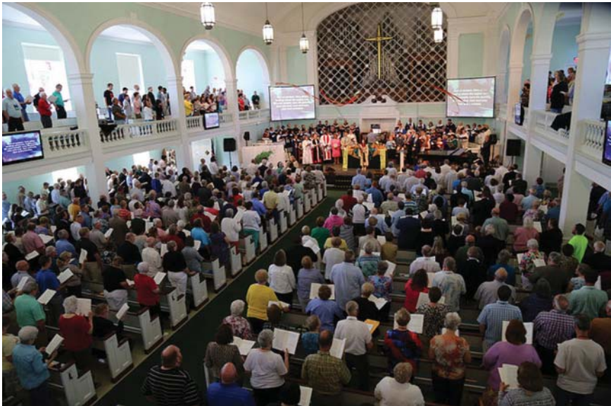
Choir members wave banners during Opening Worship at Annual Conference 2016