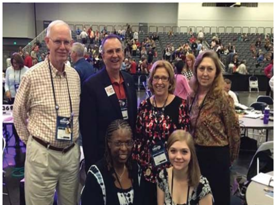
General Conference delegates in Portland, Oregon, May 2016