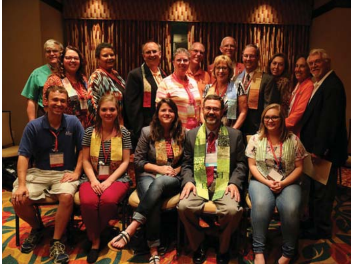
Northeastern Jurisdiction Delegation in Lancaster, PA, July 2016