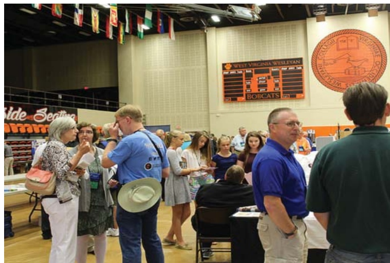
Ministry Fair 2016