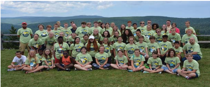
Participants at Rally on the Mountain July 2016