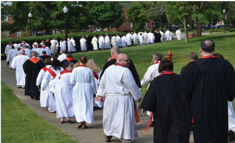
Participants in the Ordination Service line up to process into the service.

Processional hymn was “Holy, Holy, Holy! Lord, God Almighty.” Other hymns included “He Who Began A Good Work In You;” “O Church of God, United;” and “As The Deer.” Recessional Hymn was “God, the Spirit, Guide and Guardian.”