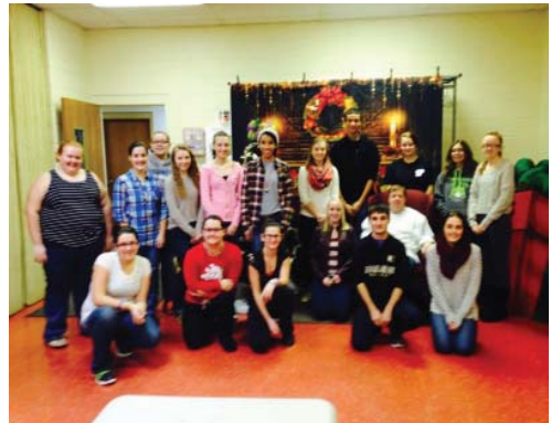
B-UHS Pro-start class helps with Christmas Dinner prep work!