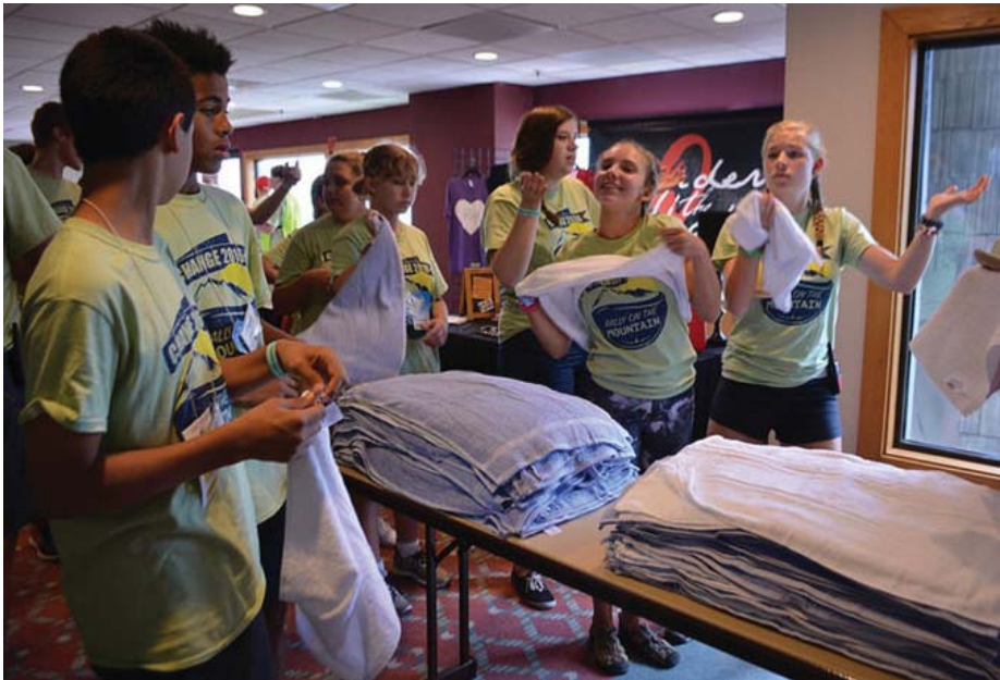
Youth at the Rally on the Mountain in July 2016 prepare Health Kits to replace those distributed during the Flood Relief efforts.