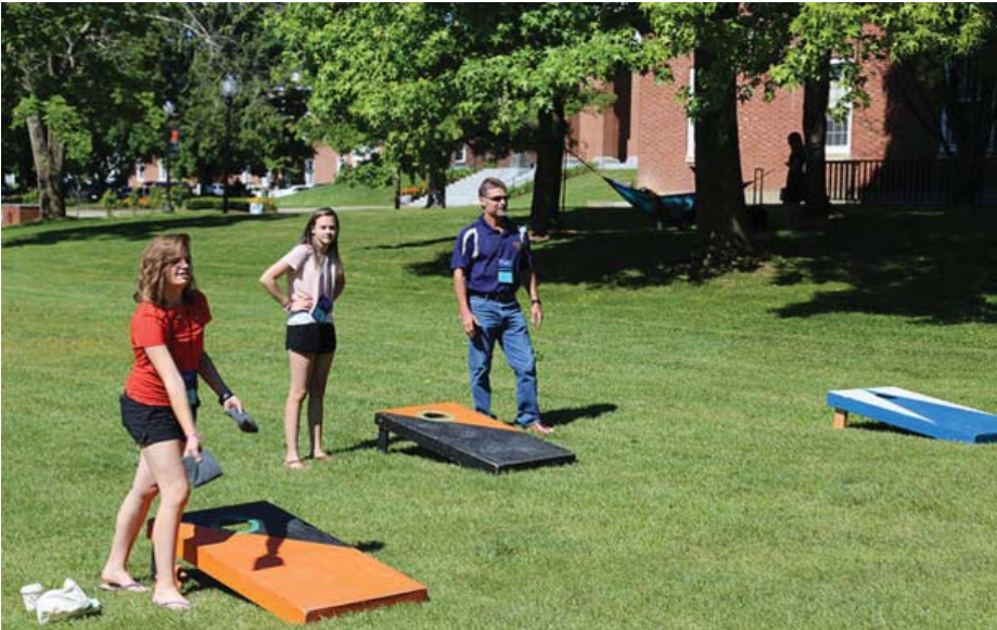
Young people experience fellowship during registration for Annual Conference