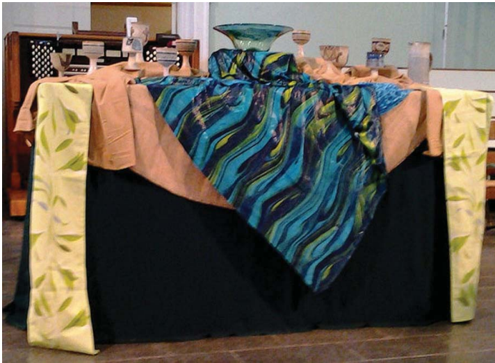
Worship Center for Opening Communion Service