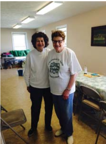
WV UMW at the mission weekend in May