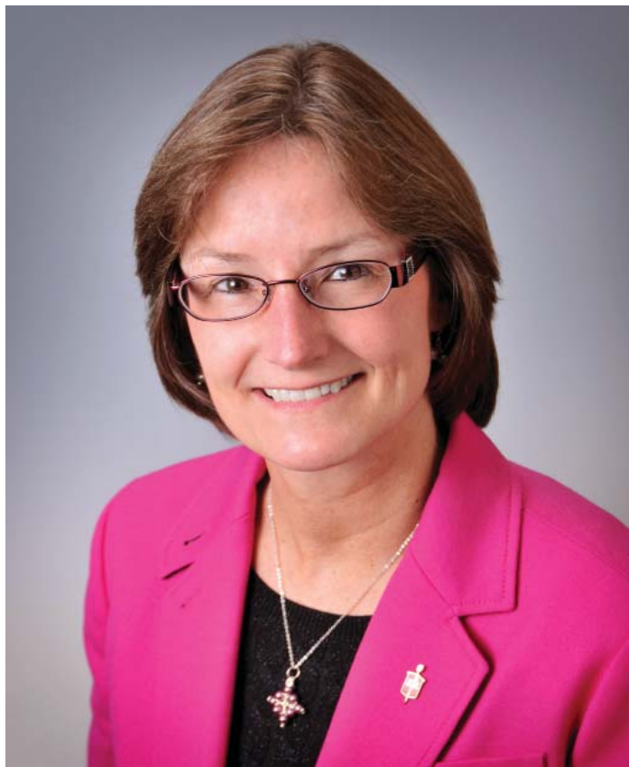
Bishop Sandra Steiner Ball Resident and Presiding Bishop September 1, 2012 -