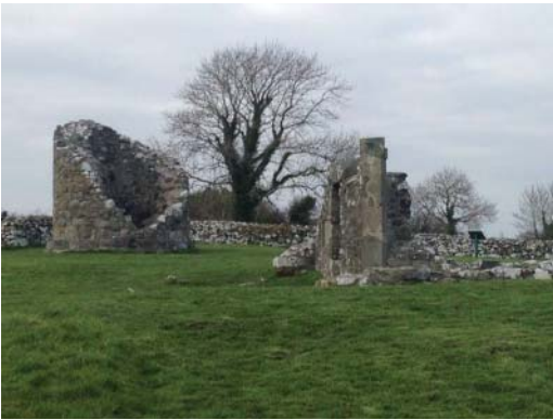
Holy site of Nendrum, where St. Patrick might have walked

Service” (their Mothers’ Day) and helped us to visit some of the most beautiful places in the world including the Giant’s Causeway, the Antrim Coast, Ulster-American Folk Park, and Nendrum, a historical holy site where St. Patrick once walked. We look forward to more opportunities to share in ministry together with our Irish friends here and across the pond!