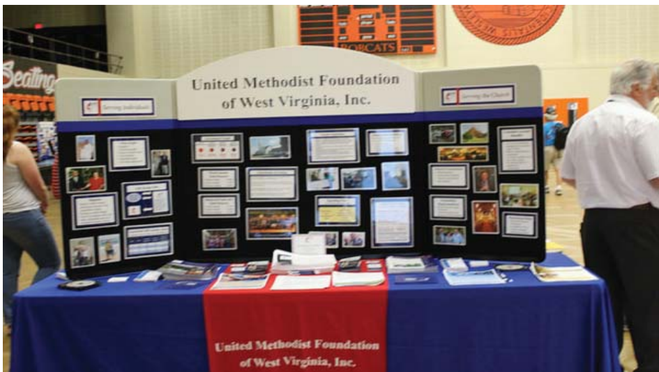
Ministry Fair Booth for the United Methodist Foundation

World AIDS Day – December 1, 2017 – as recommended by Global Ministries team.