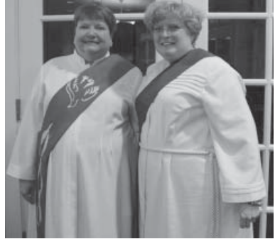
photograph by Adam Cunningham, 2011